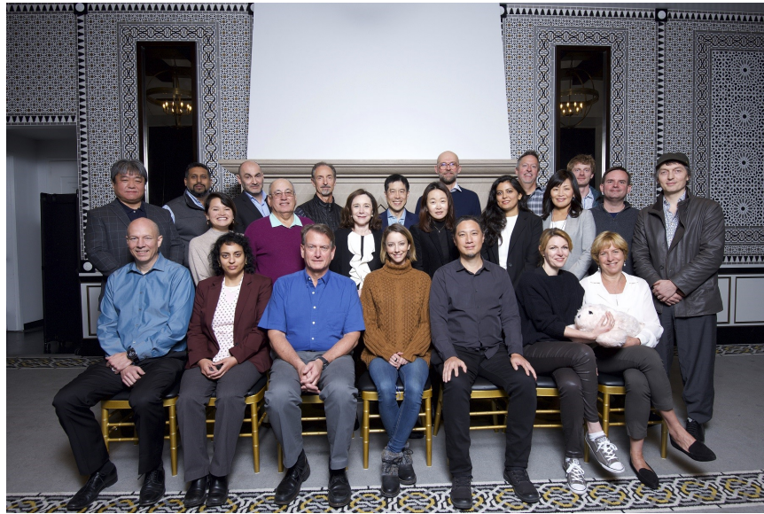
Participants from the Fourth Annual Roundtable on Artificial Intelligence (January 2020)

Some argue that for all of the advances unlocked by these intelligent technologies, deep social inequities remain, and indeed are exacerbated by the use of AI.